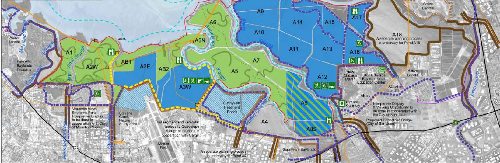
Figure ES-3b. Alternative B: Managed Pond Emphasis Alviso Year 50